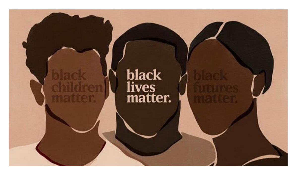
Artwork by <a>@sacree_frangine</a>